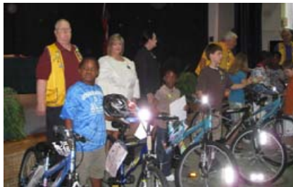
PALMER STONE BIKE PROGRAM