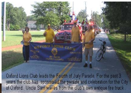
JULY 4TH PARADE

Oxford Lions Club leads the Fourth of July Parade. For the past 3 years the club has sponsored the parade and celebration for the City of Oxford. Uncle Sam waves from the club's own antique fire truck.